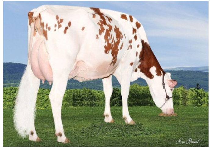
Lesperron Aikman Sofia-Red VG-87 EX-90

Forward x Crialis RF x Rubels-Red x GP-84 Salvatore Rc x Rubicon x GP-83 Cashcoin x VG-87 Snowman x EX-90 Planet x VG-85 Bolton x VG-87 Goldwyn