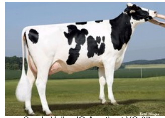
Sandy-Valley IO Amethyst VG-87