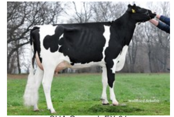
SHA Gerenuk EX-91