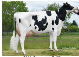
SHA Grumeti VG-87