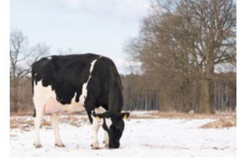
WEH Georgia VG-87

Comeback x Beachboy x GP-83 Timberlake x Benz x VG-87 Rubicon x EX-91 Balisto x VG-87 Numero Uno x VG-87 Baxter x VG-86 Goldwyn x VG-88 Tugolo