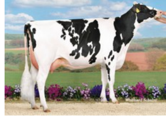
WEH Georgina VG-87