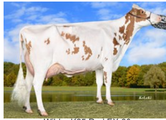
Wilder K25 Red EX-90