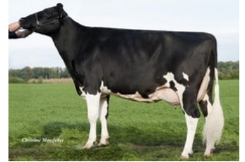
Wilder Kairo 55 RDC VG-89

Sega P RDC x Sailor PP x GP-83 Gywer RDC x GP-82 Styx Red x VG-88 Battlecry x EX-90 Brekem RDC x VG-88 Snowman x VG-89 Shottle x VG-88 Ramos x GP-84 Danube-Red