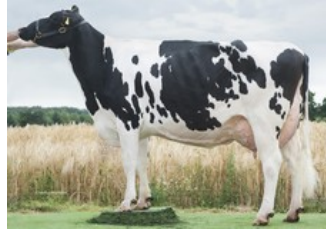
Wilder Kanu 111 RDC VG-88