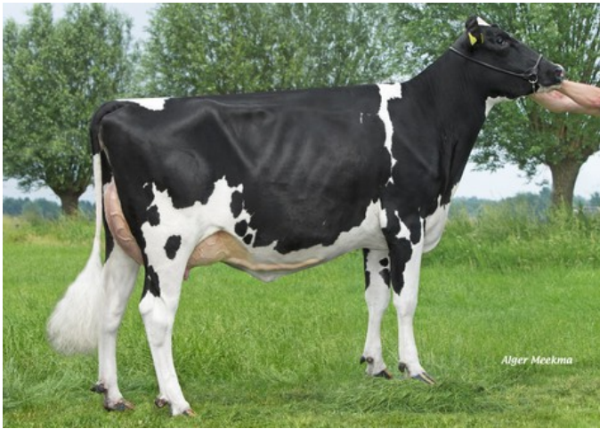
Wilder Kalibra RDC VG-88