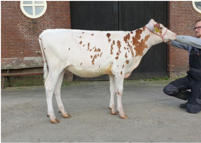
Rh Ramm Aimy Red