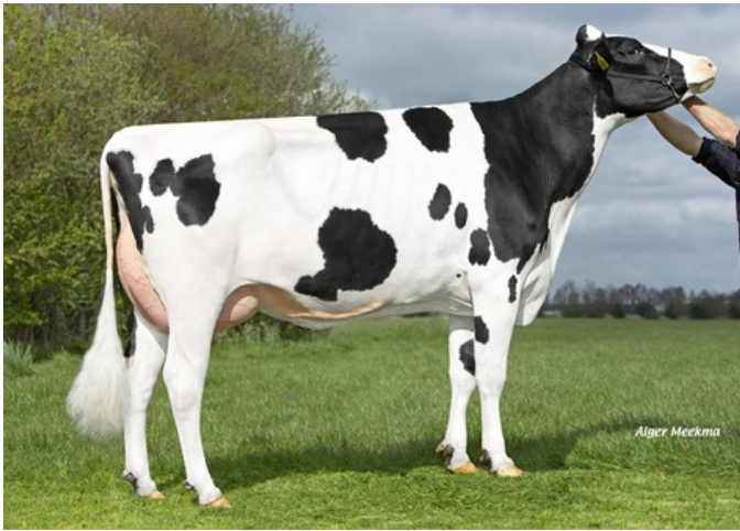
Koepon Altuve Range 7 RDC VG-87