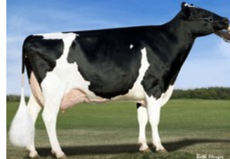
KHW Goldwyn Aiiko RDC EX-91