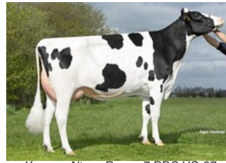
Koepon Altuve Range 7 RDC VG-87