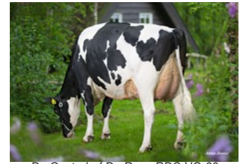
De Oosterhof Dg Rose RDC VG-89