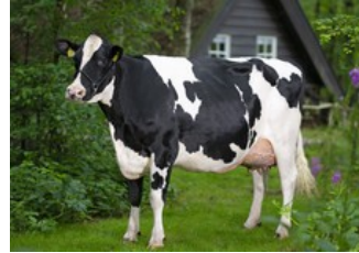
De Oosterhof Dg Rose RDC VG-89