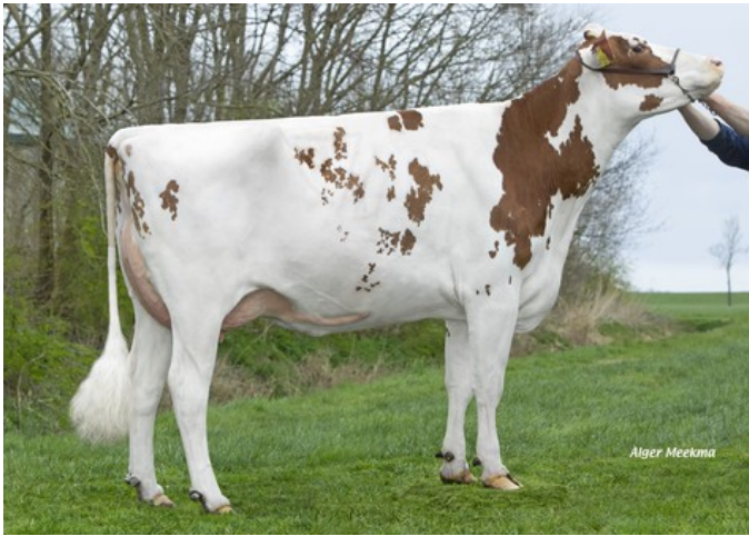
Lakeside Ups Red Range VG-86