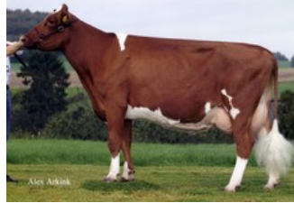
Apina Massia 21 EX-90