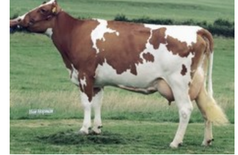
Apina Massia 14 VG-85

Warren P RF x VG-85 Martin x GP-84 Yoda x VG-85 Mission P RDC x VG-88 Apoll P Red x VG-85 Brekem RDC x VG-89 Snowman x EX-90 Shottle x EX-90 Lentini x VG-85 Tulip