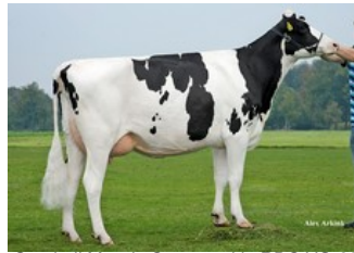
Sanderij Massia Sneeuw witje RDC VG-89