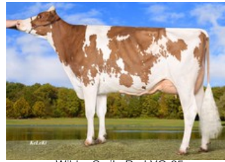
Wilder Smile Red VG-85