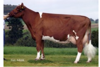
Apina Massia 21 EX-90

Warren P RF x VG-85 Martin x GP-84 Yoda x VG-85 Mission P RDC x VG-88 Apoll P Red x VG-85 Brekem RDC x VG-89 Snowman x EX-90 Shottle x EX-90 Lentini x VG-85 Tulip