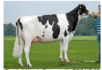
Sanderij Massia Sneeuw witje RDC VG-89