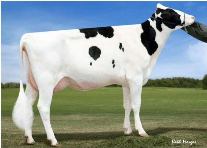
Butlerview Colt Pixie VG-87