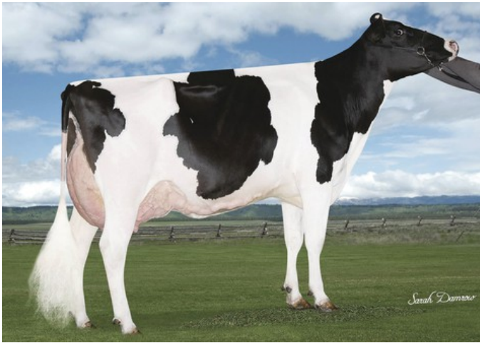
End-Road Profit 2203-ET EX-91