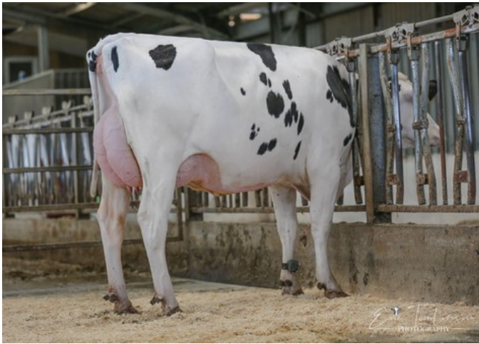
WILLSBRO TROPIC LILA Z 547 VG-85