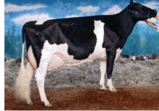
Lylehaven Form Laura EX-94