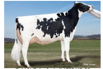
Gold-N-Oaks Arabell 1765 VG-88