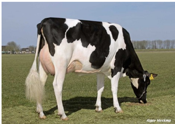
Koepon Stormatic Reginia VG-89