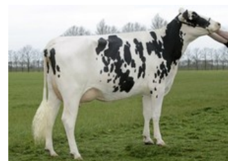
Koepon Shottle Regenia 10 VG-86