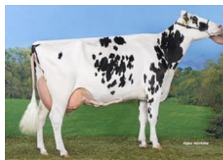
Koepon Col Regenia 37 EX-90