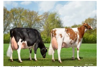
Willsbro K&L Nugget Aderyn RDC & K&L Money P Red VG-88