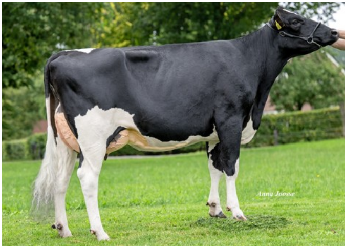
Visstein 3STAR Adoribelle RDC VG-86