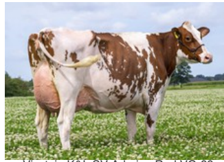
Visstein K&L SV Aderina Red VG-89