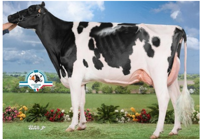
Hermine Tual, family of Maybelline VG-85

Ridercup x AltaZazzle x Kenobi x Granite x VG-85 Rubicon x GP-84 Cashcoin x VG-86 Man-O-Man x VG-86 Shottle x GP-84 Finley x Brett