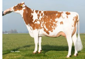
Batouwe Salsa Aiko Red VG-85