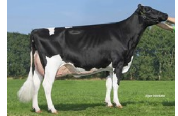
A-L-H Australia RDC VG-87

Mcdonald-P-Red x VG-86 Solitair P Red x Alaska Red x VG-85 Salsa RC x VG-87 Supersire x VG-85 Alexander x EX-91 Goldwyn x EX-95 Durham x EX-93 Prelude x EX-94 Jubilant RF