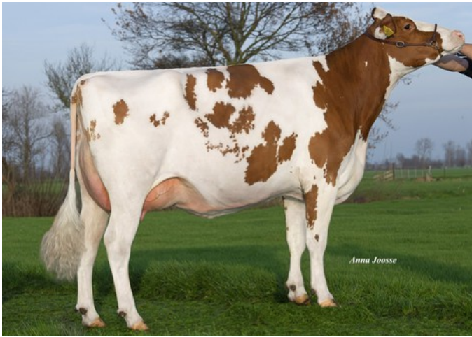
Batouwe Ailisha Salva Red VG-85