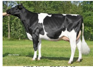
NRP Alisha RDC VG-89