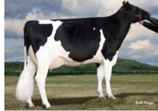
KHW Goldwyn Aiko RC EX-91