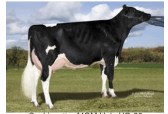
Cookiecutter MOM Halo VG-88