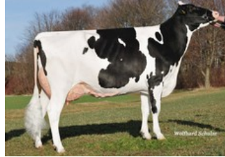
ZT Elaine VG-86