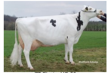
ZT Electra VG-88