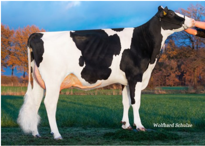
HWH 3STAR Ella P RDC VG-87