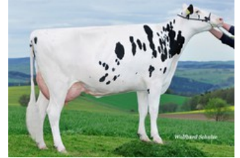
ZT Elisha VG-85

Ridercup x VG-87 Solitair P Red x VG-87 Polo P RDC x VG-86 Balisto x VG-85 Gold Chip x VG-88 Alves x VG-86 Enos