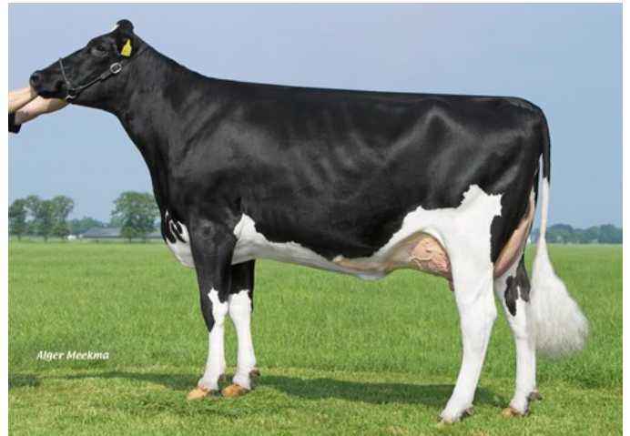
Willsbro K&L Nugget Aderyn RDC VG-86

Ridercup x VG-86 Rubels-Red x VG-89 Salvatore Rc x VG-86 Nugget RDC x VG-85 Supersire x EX-90 Superstition x EX-91 Goldwyn x EX-95 Durham x EX-93 Prelude x EX-94 Jubilant RF