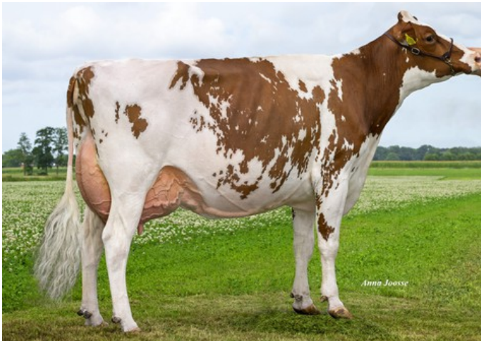
Visstein K&L SV Aderina Red VG-89