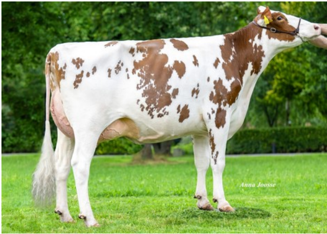
Visstein 3STAR Adalicia Red VG-88