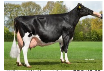
Willsbro K&L Nugget Aderyn RDC VG-87