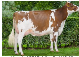
Visstein 3STAR Adiva Red VG-87