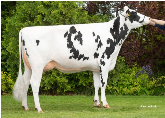
3STAR RT Patsy RDC GP-84