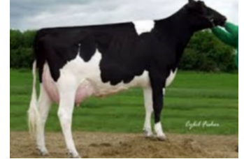
Orthoapple Marshall Alia VG-89

Rainow x Bali x VG-86 Gymnast x VG-86 Supershot x VG-85 McCutchen x VG-87 Altalota x VG-87 Planet x EX-92 Bolton x VG-87 Forbidden x VG-89 BW Marshall