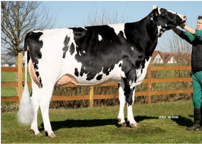
Alida ET VG-86