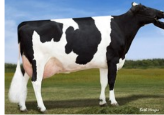
Sandy-Valley Bolt Sheila EX-92