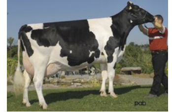
Gen-I-Beq Durham Sherry VG-87

Trumpet-Red x Rubels-Red x GP-84 Salvatore Rc x Rubicon x GP-83 Cashcoin x VG-87 Snowman x EX-90 Planet x VG-85 Bolton x VG-87 Goldwyn x VG-87 Durham