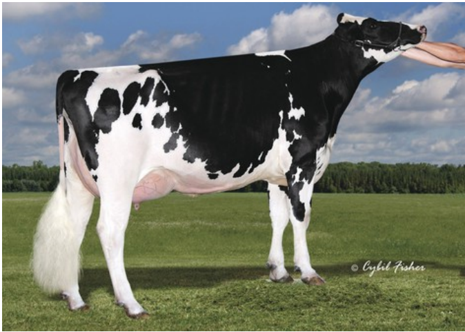
Cookiecutter Epic Hazel-ET EX-92