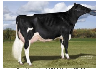
Cookiecutter MOM Halo VG-88