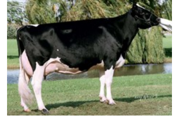
Snow-N Denises Dellia EX-95

Migel x VG-86 Copyright x Benz x VG-87 Battlecry x EX-92 Montross x EX-92 Epic x VG-88 Man-O-Man x VG-88 Goldwyn x EX-90 Champion x EX-90 Hershel