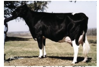
Long-Haven Rudolph Dee EX-90