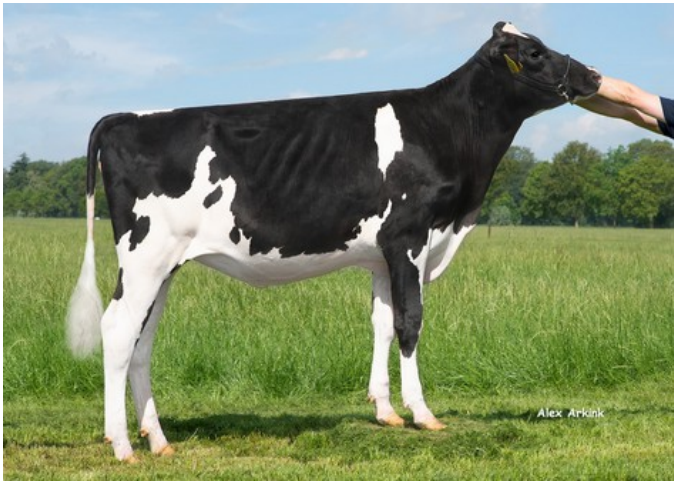
De Oosterhof DG Leida GP-83