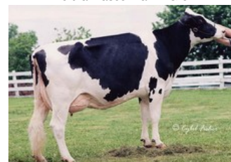
Mayerlane-DK Hiawatha EX-90

FrisbeeRDC x VG-86 AltaTop-Red x VG-86 Salvatore Rc x VG-89 Rubicon x GP-83 Aikman RDC x VG-85 Man-O-Man x VG-87 Mascol x VG-88 Durham x EX-90 Rudolph x EX-95 Chief Mark