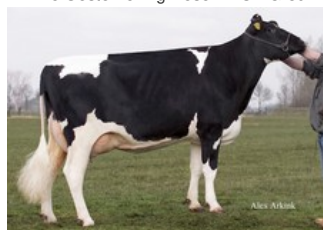
Sunday ALH Prudence VG-88