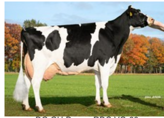
DG OH Donna RDC VG-89