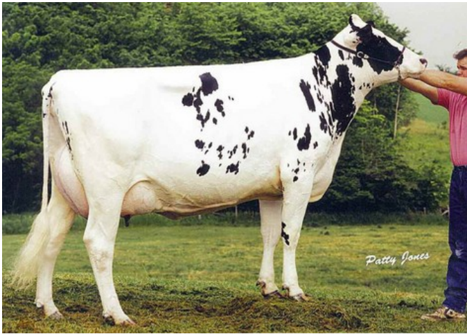
Glen Drummond Shower EX