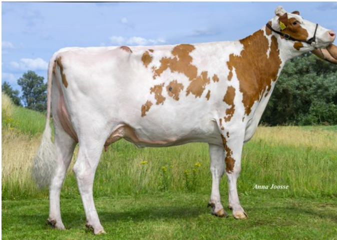
R&B Altatop Aivy Red