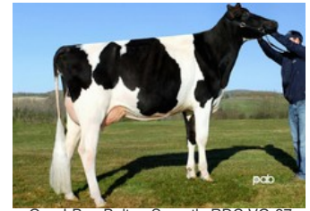
Gen-I-Beq Bolton Secretly RDC VG-87