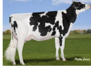
Gen-I-Beq Snowman Summer RDC VG-85