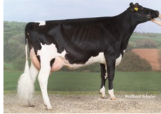
CCC Goldwyn Konny VG-87