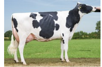
Wil Honig, Lineman sister to Hilma GP-84

Altamagnifique x VG-85 Charl x GP-84 Pledge x VG-85 Saloon x VG-85 Snowman x VG-87 Goldwyn x EX-94 Outside x VG-88 Lee x VG-85 Starleader x VG-89 Raider AltaMagnefique with A2A2 & good gTPI score and high NM.