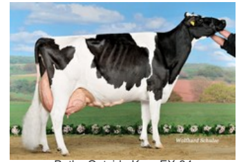
Batke Outside Kora EX-94