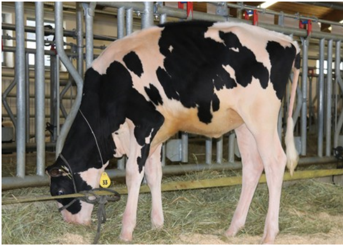
Wilder Holiday Season