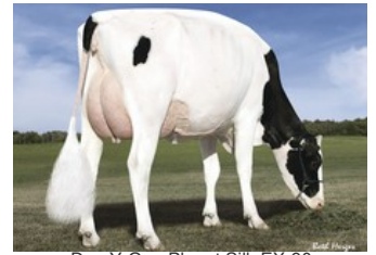
Des-Y-Gen Planet Silk EX-90