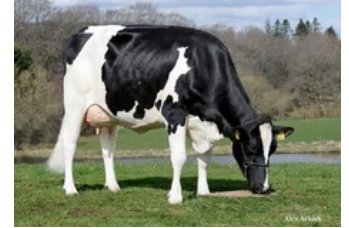
Tirs vad Limbo Gatsby VG-88

AltaZazzle x Charl x VG-89 Sniper x VG-87 Silver x VG-87 Massey x VG-88 Limbo x VG-86 Stol Joc x VG-86 O Man x VG-87 Aaron x EX-91 Esquimau