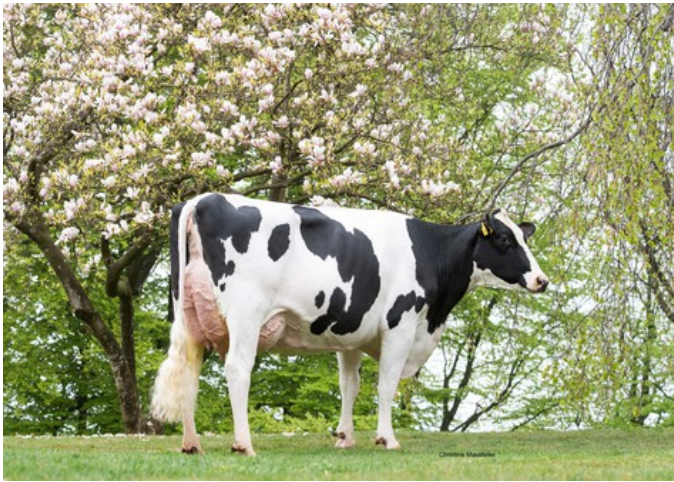
Tirs vad Charl Galathea