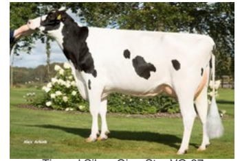
Tirs vad Silver Giga-Star VG-87