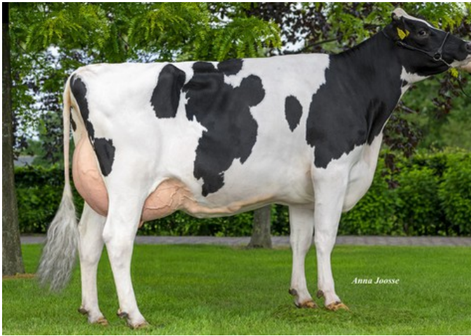
3STAR OH Minka VG-86