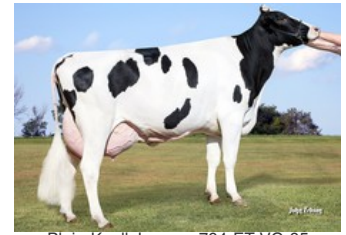
Plain-Knoll Josuper 794-ET VG-85