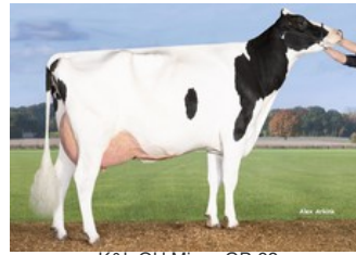
K&L OH Mirror GP-82