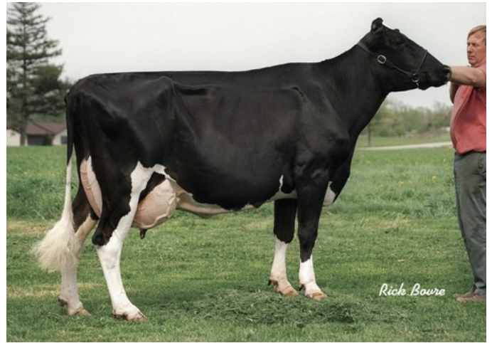
Wesswood-HC Rudy Missy EX-92

Donnelly x VG-86 Hotspot P x VG-86 Jedi x Supershot x Doorman x VG-87 Robust x VG-87 Zenith x VG-86 Shottle x VG-86 O Man x EX-92 Rudolph