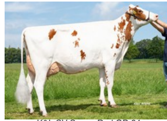
K&L SV Sunny Red GP-84