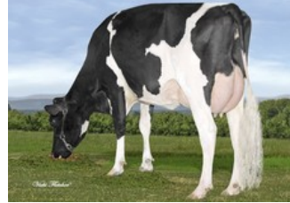
Gen-I-Beq Bolton Silence VG-85