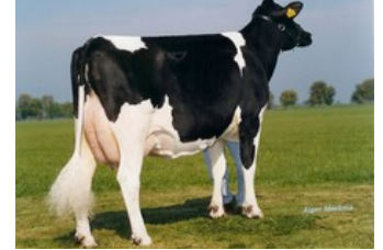
Koepon Classy VG-86

GP-82 Brave x GP-82 Soundcloud x GP-83 Imax x Silver x GP-83 AltaOak x VG-85 Man-O-Man x VG-85 Shottle x VG-86 Simon x VG-86 Merrill x VG-88 Bell Elton