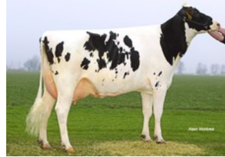
Koepon Shot Classy 17 VG-85