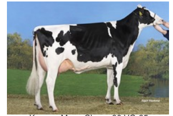
Koepon Mano Classy 90 VG-85