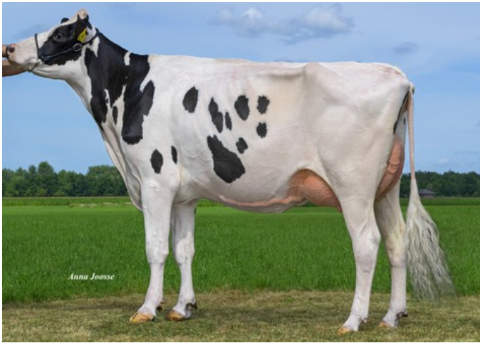
Drouner K&L Claxima 1706 GP-82