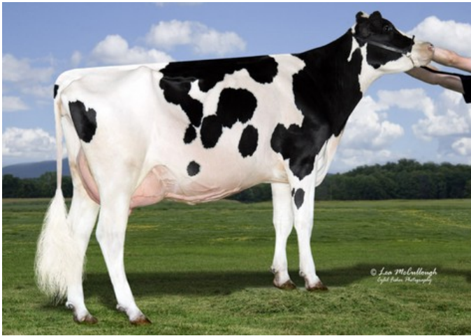
Woodcrest Mogul Pretty VG-87