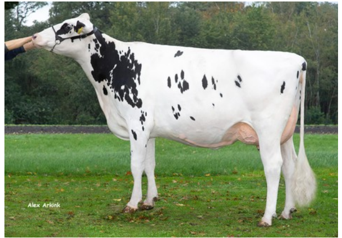
Diekers K&L DL Whiskey RDC VG-85

Freestyle-Red x VG-85 AltaDateline x GP-84 Salvatore Rc x Rubicon x GP-83 Cashcoin x VG-87 Snowman x EX-90 Planet x VG-85 Bolton x VG-87 Goldwyn x VG-87 Durham