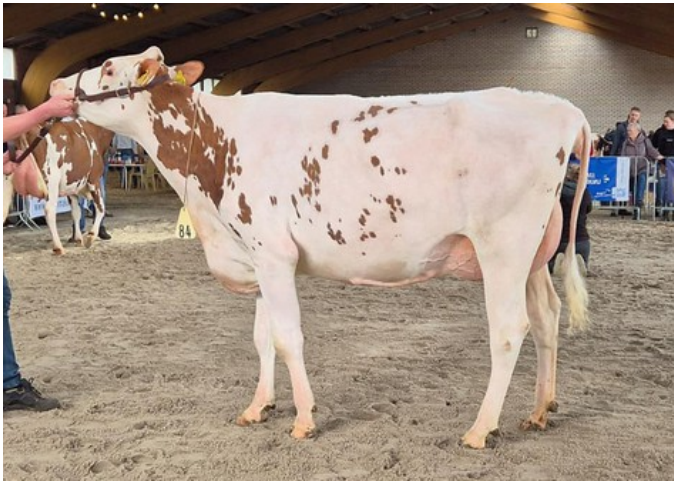
Diekers 3STAR OH Florijn