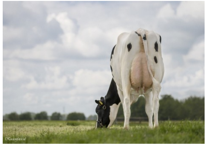
PR Shauny VG-88

VG-87 Arrow x GP-83 Pharo x VG-88 Modesty x GP-83 McCutchen x VG-87 Man-O-Man x EX-92 Planet x VG-86 Shottle x VG-86 O Man x EX-92 Rudolph x EX-90 Bell Elton