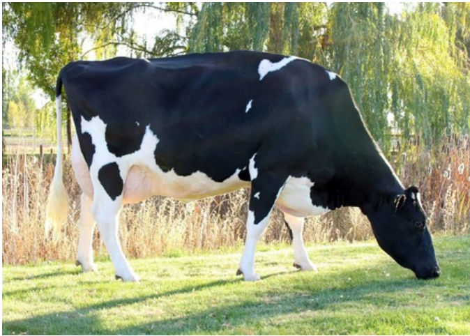
Ammon-Peachey Shauna EX-92