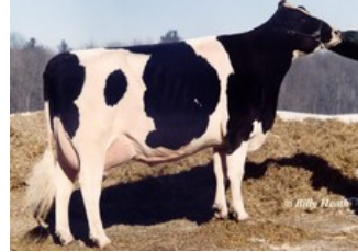
Ralma Durham Frisky VG-88