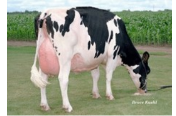
Ralma Juror Faith EX-91

Nippon P x Jacuzzi-Red x VG-89 Balisto x VG-87 Goli x EX-90 Goldwyn x VG-86 Shottle x VG-88 Durham x EX-91 Ked Juror x VG-89 Leadman x Melwood