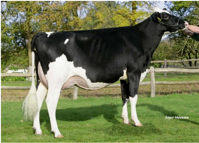
Bouw Goli Flower VG-87