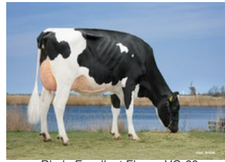
Rhala Excellent Flower VG-89