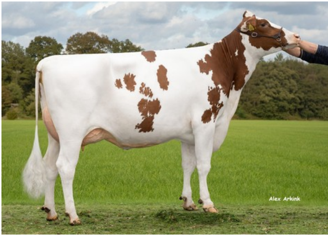
De Oosterhof 3STAR Juliane Red