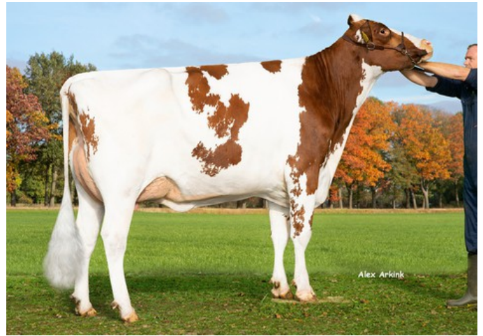
3STAR OH Alexia Red GP-84

Star P RDC x GP-84 Rubels-Red x VG-85 Salvatore Rc x VG-89 Rubicon x VG-87 Supersire x VG-85 Alexander x EX-91 Goldwyn x EX-95 Durham x EX-93 Prelude x EX-94 Jubilant RF