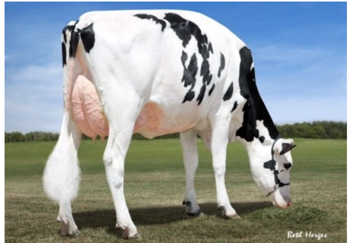
Dymentholm Sunview Sunday VG-87

Crisalis RF x Rubels-Red x GP-84 Salvatore Rc x Rubicon x GP-83 Cashcoin x VG-87 Snowman x EX-90 Planet x VG-85 Bolton x VG-87 Goldwyn x VG-87 Durham