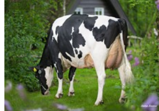
De Oosterhof Dg Rose RDC VG-89