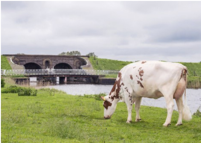
Lakeside Ups Red Range VG-86