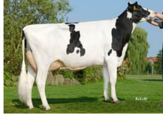
KHE India VG-88