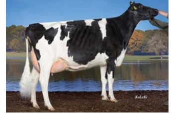
KHE Illinois VG-88

Star P RDC x Durable x VG-87 Gymnast x VG-87 Rubicon x VG-89 Shotglass x VG-88 Windbrook x VG-88 Jeeves x VG-85 Goldwyn x VG-85 Juror Ford x VG-85 Cleo