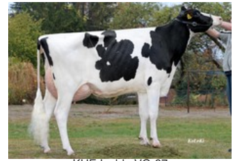
KHE Isolde VG-87