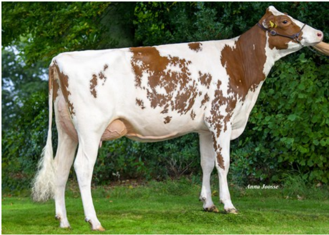
Salsa P Red VG-87