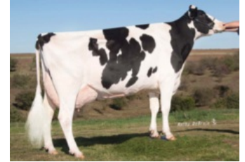
Jenniton Bolton Rowena EX-90

VG-87 Money P x VG-86 Stormy Red x GP-83 Salvatore Rc x Yoder x VG-85 Donatello x EX-90 Man-O-Man x EX-90 Bolton x EX-90 Boss Iron x EX-90 Rudolph x VG-88 Chief Mark