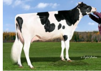
Jenniton M-O-M Savana-Et EX-90