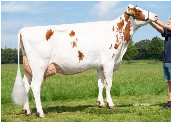
K&L SV Sunny Red GP-84