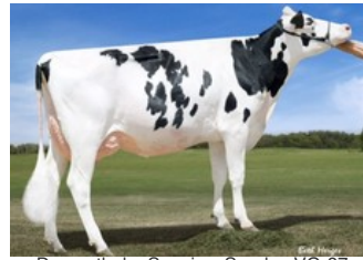
Dymenholm Sunview Sunday VG-87